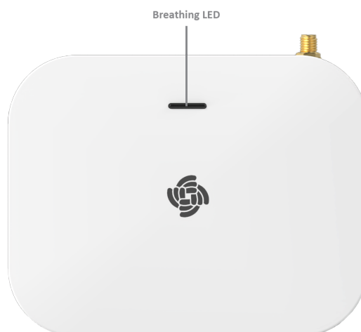
Figure 1: RAK7268/C WisGte Edge Lite 2 Top View